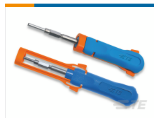
TE Part # 539972-1 EXTRACTION TOOL