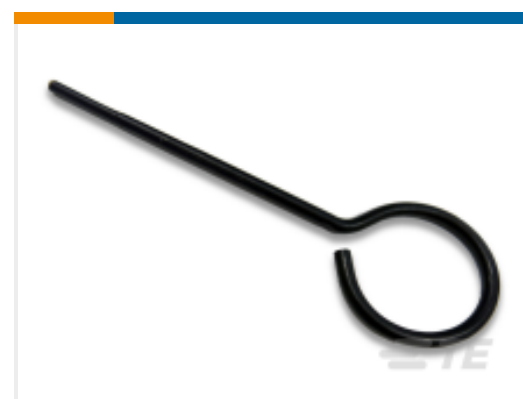
TE Part # 200893-2 INSERTION TOOL CONT