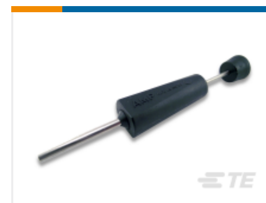
TE Part # 305183 EXTRACT TOOL TYPE 2 20-16